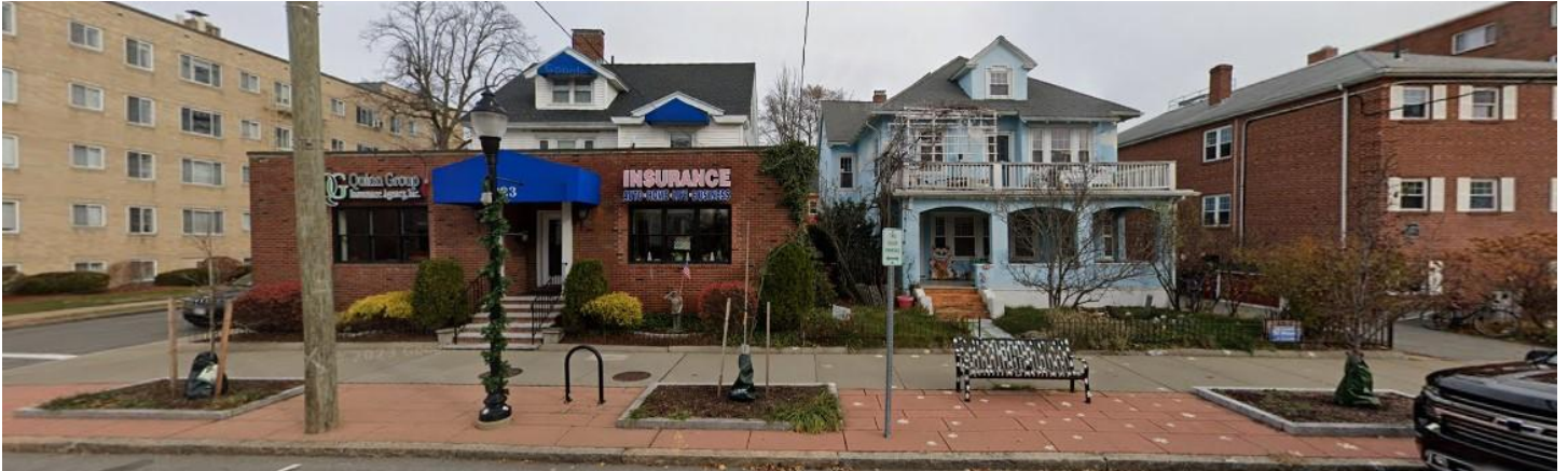
Mass Ave between Oxford and Winter