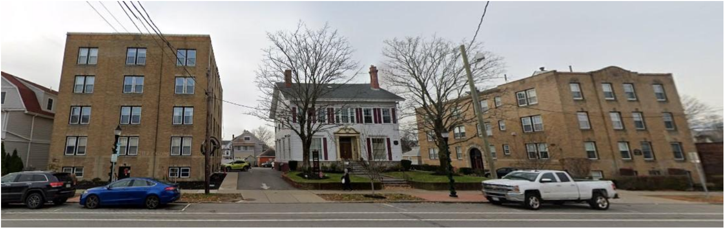
Mass Ave between Orvis and Lake