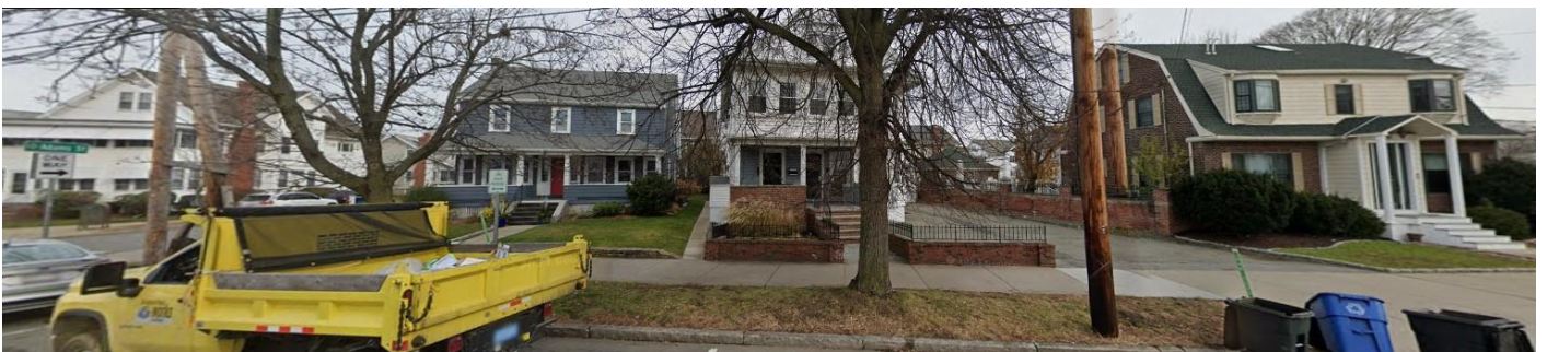
Mass Ave between Foster and Adams