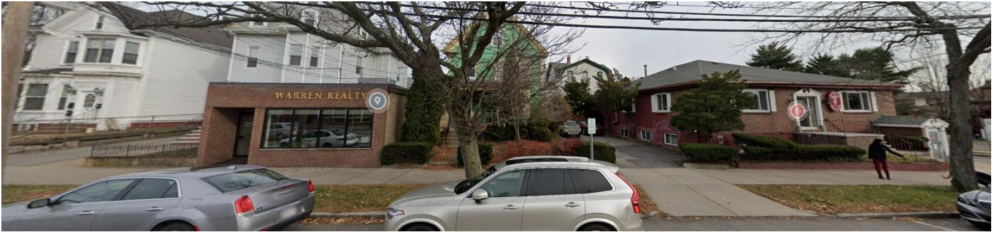
Mass Ave between Henderson and Teel