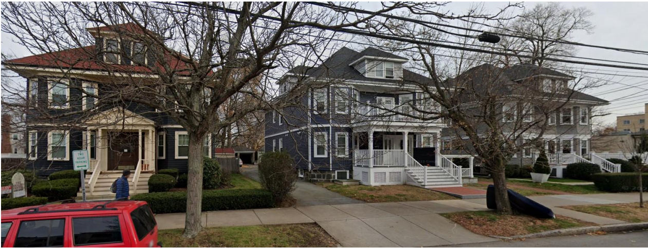
Mass Ave between Everett and Harlow