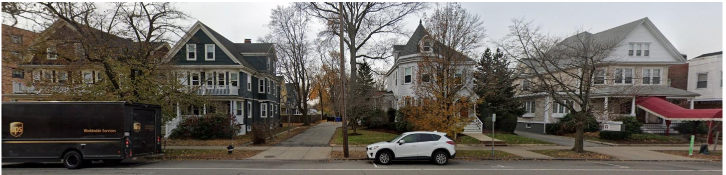
Mass Ave between Marion and Linwood